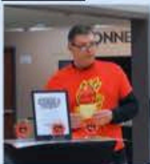
Chili Cookoff (2/24/24)

Balancing out the work, the men also made time to gather for fun and fellowship with multiple Social Events: