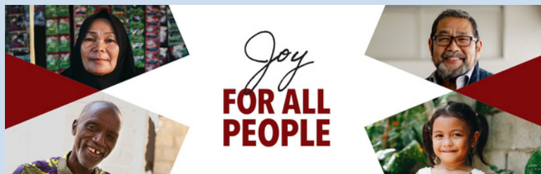
Alliance Christmas Offering, 12/22/24