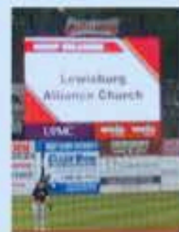
Crosscutters Baseball (6/11/24)