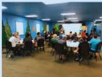
Men's Breakfast (6/1/24 & 7/13/24)