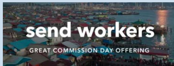
Great Commission Fund Offering, 6/9/24